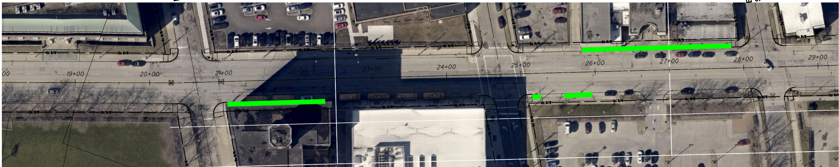
EAST 21ST STREET TO EAST 23RD STREET